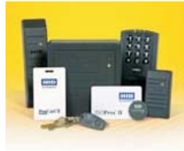
Card reader units