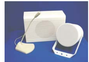
Speaker and Micro-phone

Note: This is just a selection of the products and services supplied by Rondish. Please call if you have any related requirement.