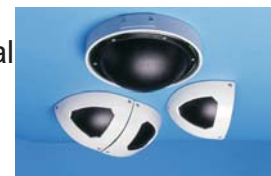
Vandal resistant camera

Note: 5 years warranty for Norbain products