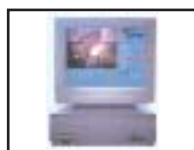
digital CCTV view through telephone or internet