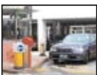
car barrier with database (radio control or card)