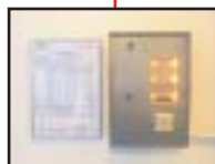
telephone door entry system