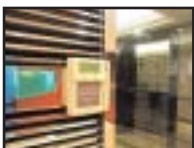
access control (cardreader)