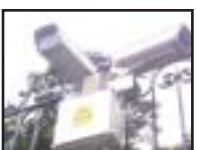
outdoor CCTV surveillance with multiplexer monitoring