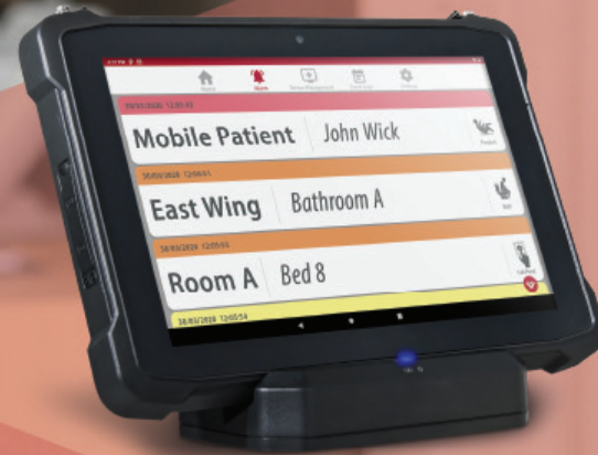
■ Nexus Master Station